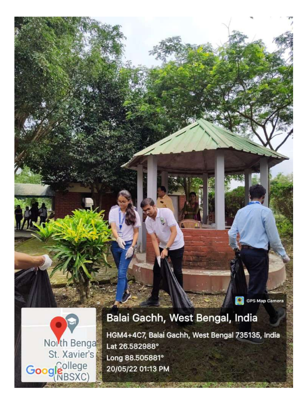
VOLUNTEERS IN SAVE SOIL MOVEMENT