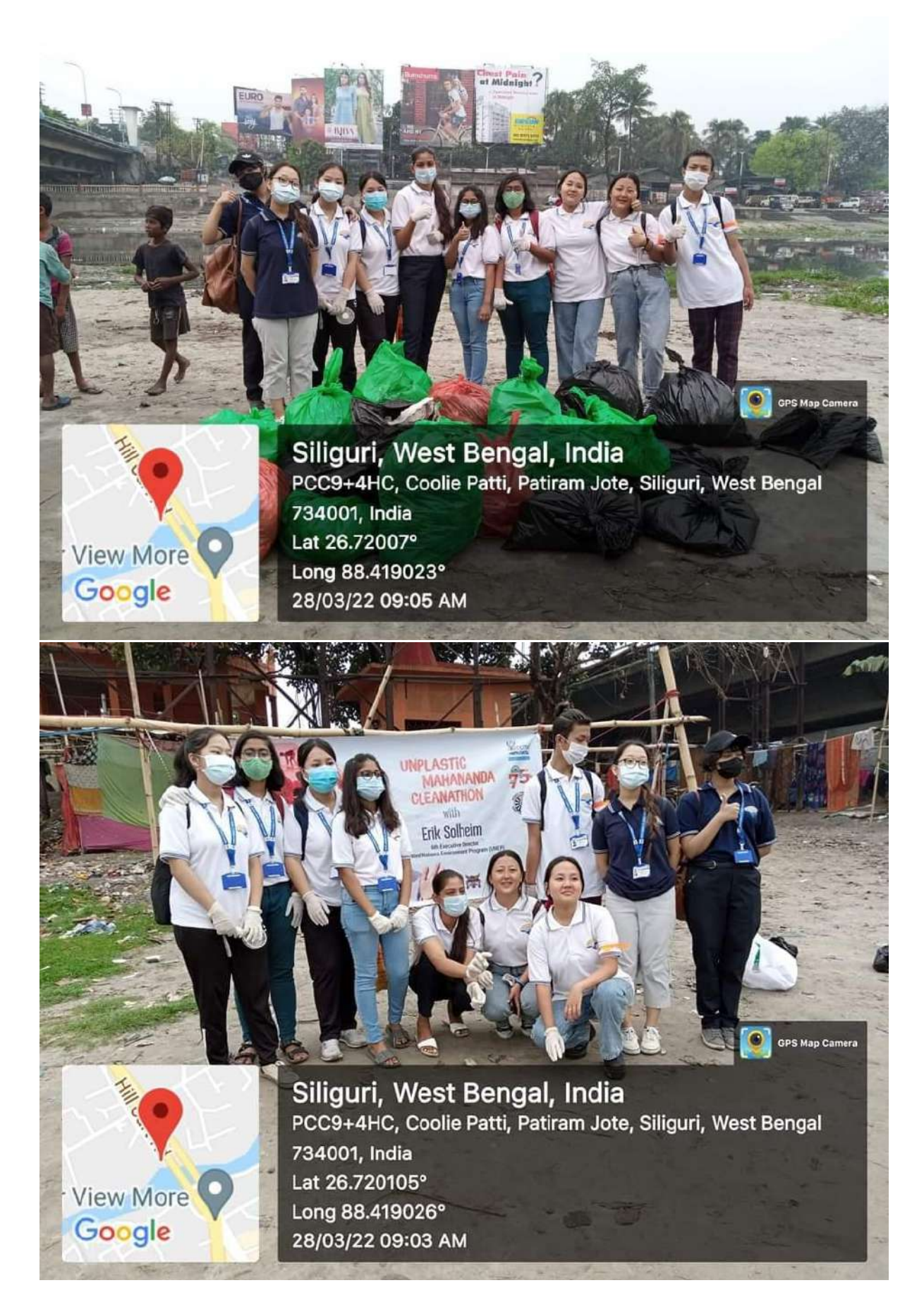
VOLUNTEERS IN UNPLASTIC MAHANANDA CLEANATHON