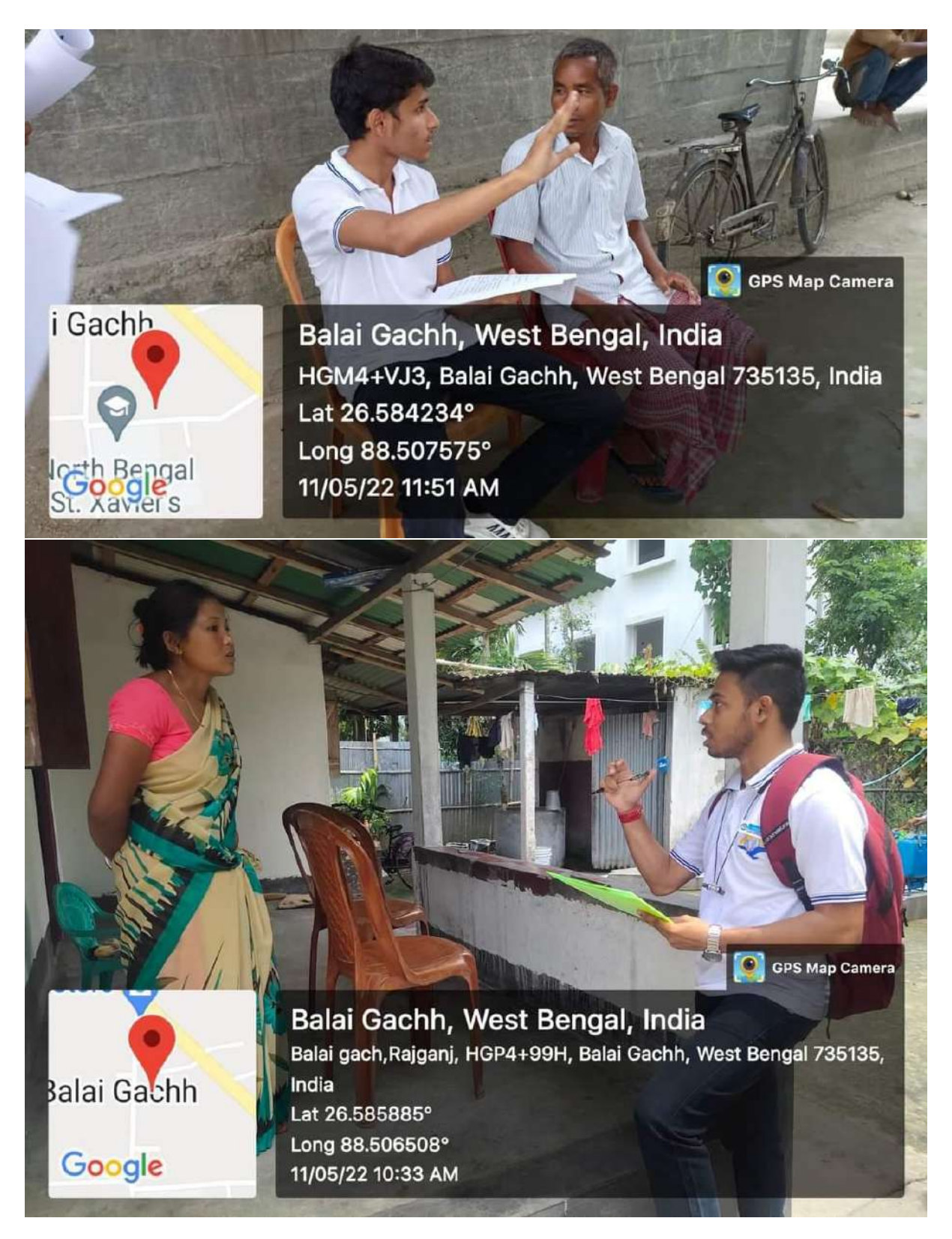
HEALTH AND HYGIENE AWARENESS SURVEY