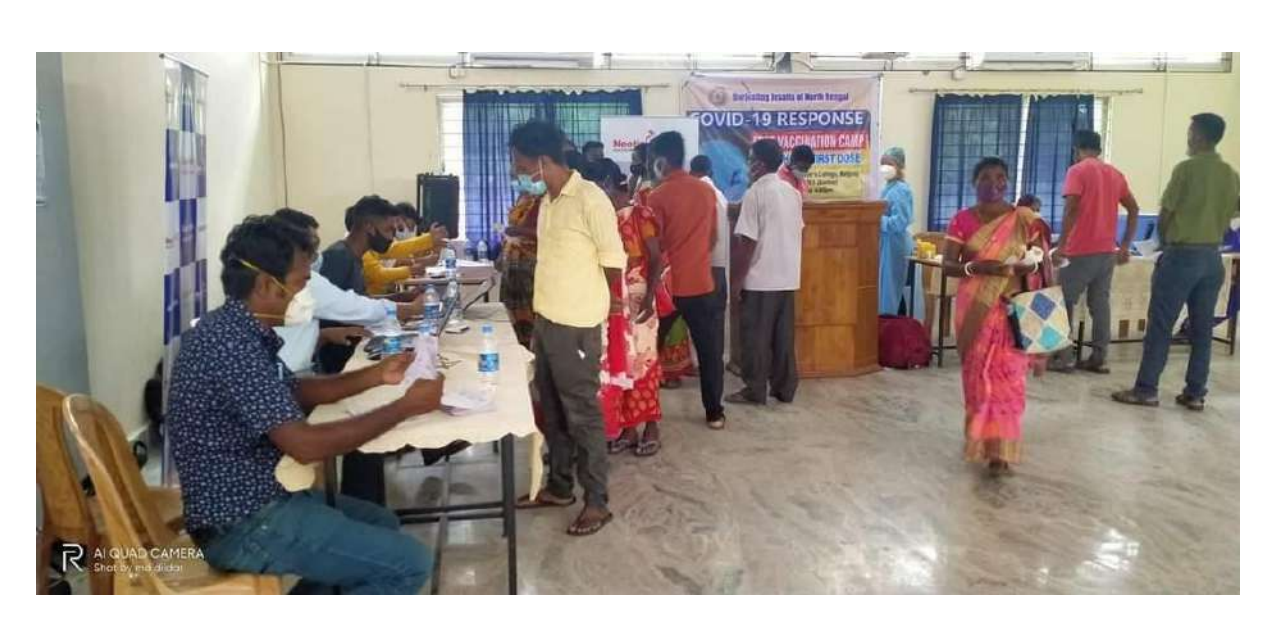
FREE COVID-19 VACCINATION CAMP FOR THE LOCAL VILLAGERS