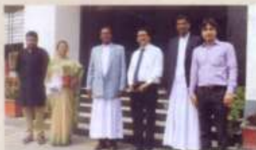
V.C.'s visit to NBSXC