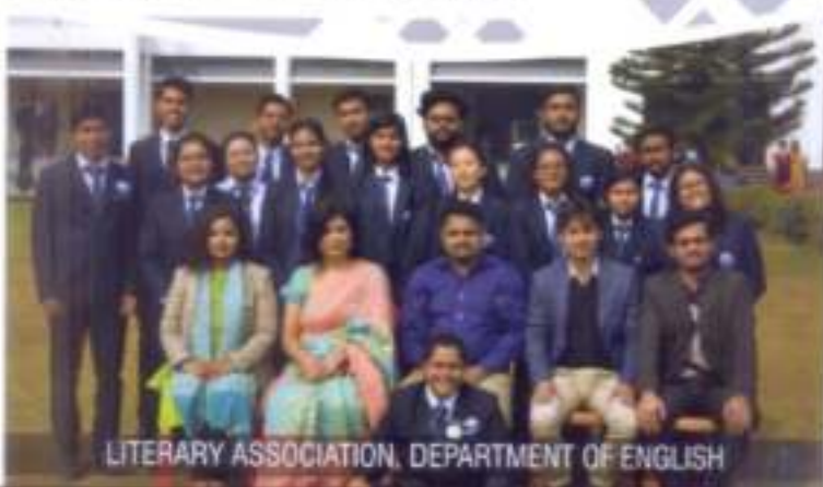
LITERARY ASSOCIATION, DEPARTMENT OF ENGLISH